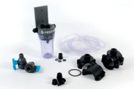
Probe Holder Kit INTP-HOLD-1