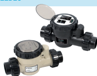
iChlor/SC-75 H-52-0800P SC-75