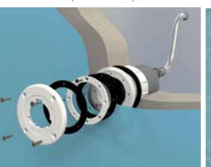
IntelliBrite-E Niche in concrete pool with liner