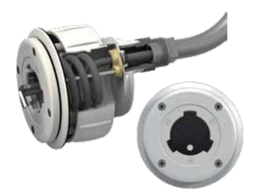
IntelliBrite-E Niche in polyester pool